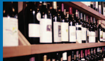
Liquor Stores/Wine Cellars