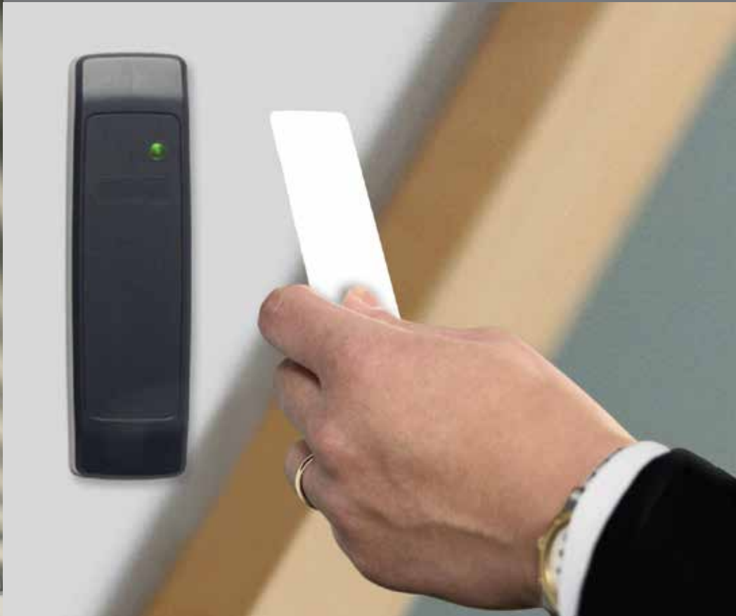
OmniClass Cards & Credentials