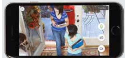
View Live Video