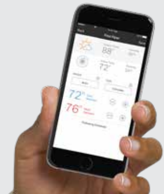
Control Z-Wave® Thermostats, Lighting, Locks and More