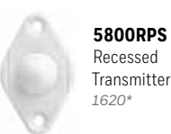
5800RPS Recessed Transmitter 1620*