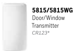
5815/5815WG Door/Window Transmitter CR123*