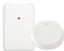
FG1625 / FG1625T Glassbreak Detector FG1625F Flush Mount Glassbreak Detector FG-1625R / FG1625RT Glassbreak Detector