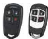
5834-4 5834-4EN Four-button Wireless Key Transmitter 3V, 210mAh*