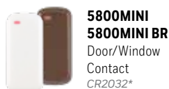
5800MINI 5800MINI BR Door/Window Contact CR2032*