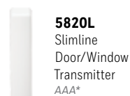
5820L Slimline Door/Window Transmitter AAA*