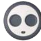
5802WXT-2 Two-button Personal Panic Transmitter CR2032*