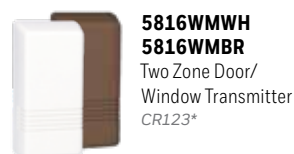
5816WMWH 5816WMBR Two Zone Door/ Window Transmitter CR123*