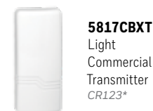
5817CBXT Light Commercial Transmitter CR123*