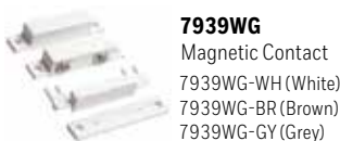
7939WG Magnetic Contact 7939WG-WH (White) 7939WG-BR (Brown) 7939WG-GY (Grey)