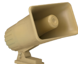
702 Self-contained Electronic Siren