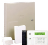
VISTAKEY V-Plex® Single Door Access Control System