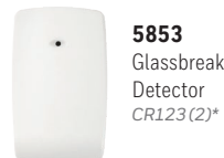
5853 Glassbreak Detector CR123 (2)*