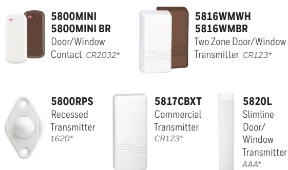
5800MINI 5800MINI BR Door/Window Contact CR2032*