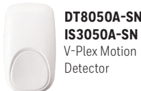
DT8050A-SN IS3050A-SN V-Plex Motion Detector