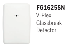
FG1625SN V-Plex Glassbreak Detector