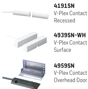
4191SN V-Plex Contact Recessed