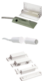
958/959/MPS52 Overhead Door Magnetic Contact