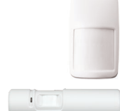
IS3035 (35') IS3050 (50') PIR Motion Detector