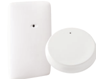
FG1625/1625T Glassbreak Detector FG1625F Flush Mount Glassbreak Detector FG-1625R / 1625RT Glassbreak Detector