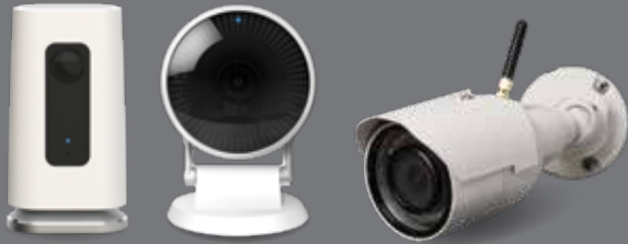
Indoor HD Cameras

Who says you can't be everywhere at once? With our HD Total Connect Video Solutions, you can see, hear and speak* and take a snapshot or video of what is occurring at your home or business all through our free app.