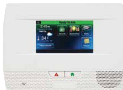
Temperature available in Fahrenheit or Celsius.