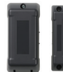
5816OD Outdoor Contact/ Transmitter Lithium*