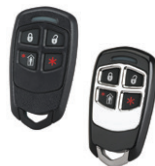
5834-4 5834-4EN (with plated bezel and key ring) Four-button Wireless Key Transmitter 3V, 210mAh*