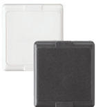
5870API-WH 5870API-GY Indoor Asset Protection Sensor CR2 (1)*