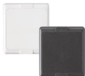
5870API-WH 5870API-GY Indoor Asset Protection Sensor CR2 (1)*