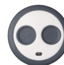
5802WXT-2 Two-button Personal Panic Transmitter CR2032*