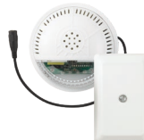
5877GDPK Garage Door Control Kit