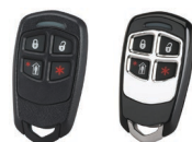
5834-4 5834-4EN Four-button Wireless Key Transmitter 3V, 210mAh*