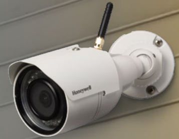
Outdoor HD Camera