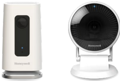
Indoor HD Cameras

With the smart video doorbell, see, hear and speak to visitors at your door, arm or disarm the security system and unlock or lock the door all from the same screen.